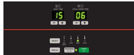
Dual Digital Control