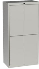
4-DOOR ADD ON