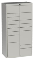
17-DOOR ADD ON