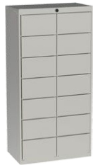
14-DOOR ADD ON