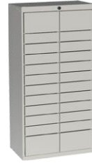
24-DOOR ADD ON