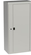
OVERSIZED ADD ON